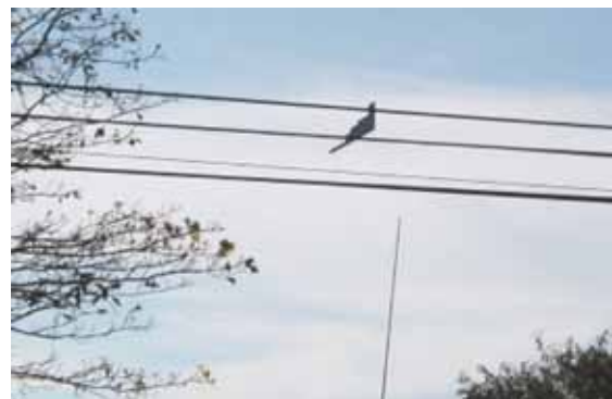
The billion-dollar B2 Stealth Bomber!

Thanks also are due to all the Lions who could help out.