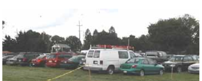
Cars, Cars, and More Cars

A brief and unexpected flyover by the B2 Stealth Bomber proved to be a genuine treat and thrill.